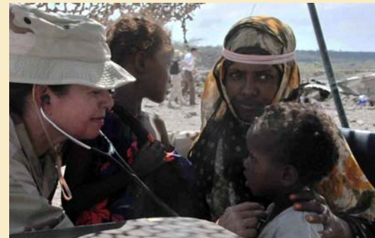
Medical/ Veterinary Civil Action Programs (MEDCAP/VETCAP)