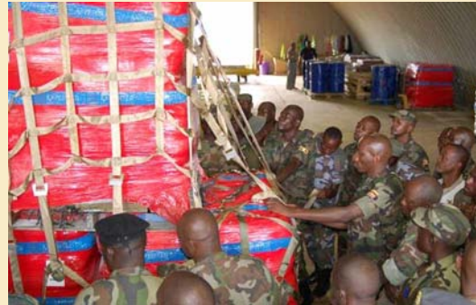
African Deployment Assistance Partnership Team (ADAPT)