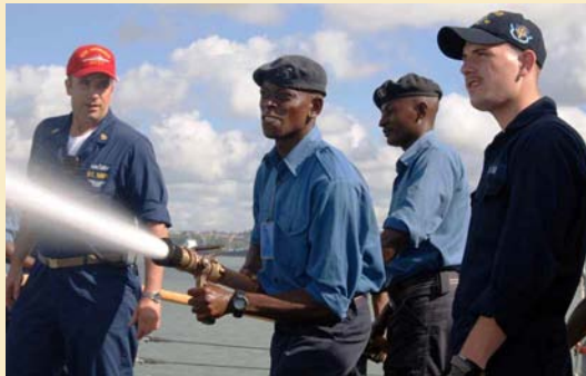
Building Maritime Security Capacity: Africa Partnership Station (APS)