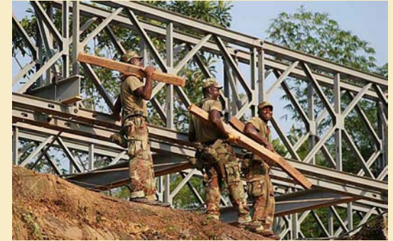
Providing Exercise Related Construction (ERC)