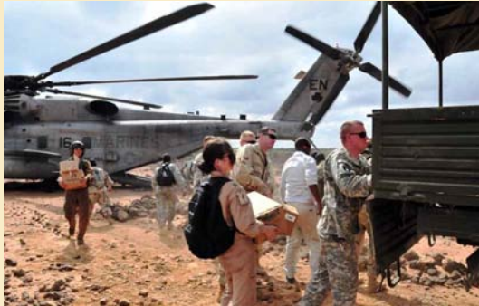
Combined Joint Task Force- Horn of Africa (CJTF-HoA)